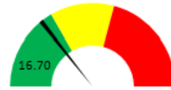
System Average On Scene Time (All Calls) (Minutes)