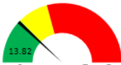
System Average On Scene Time (Stroke)(Minutes)