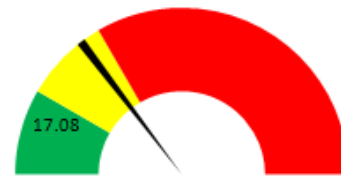
System Average On Scene Time (Trauma)(Minutes)