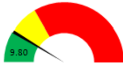
System Average Response Time (Minutes)